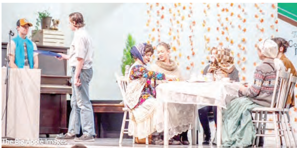
"Ladies at Lunch" was the title of this skit.