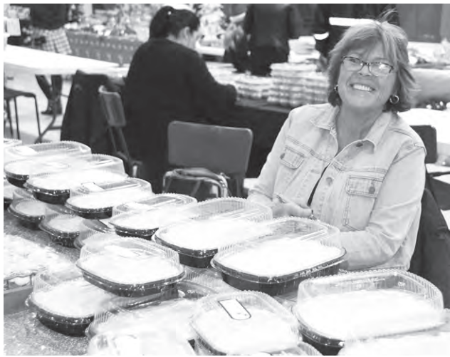
The Moundettes' Mini Mall in Pilot Mound on November 24th offered a wide variety of Christmas related items and gift ideas.