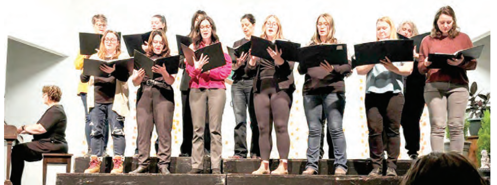
The adult choir members.