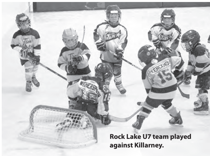
Rock Lake U7 team played against Killarney.