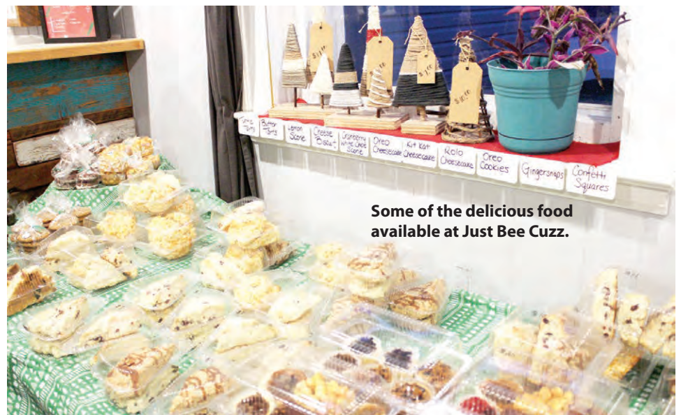
Some of the delicious food available at Just Bee Cuzz.