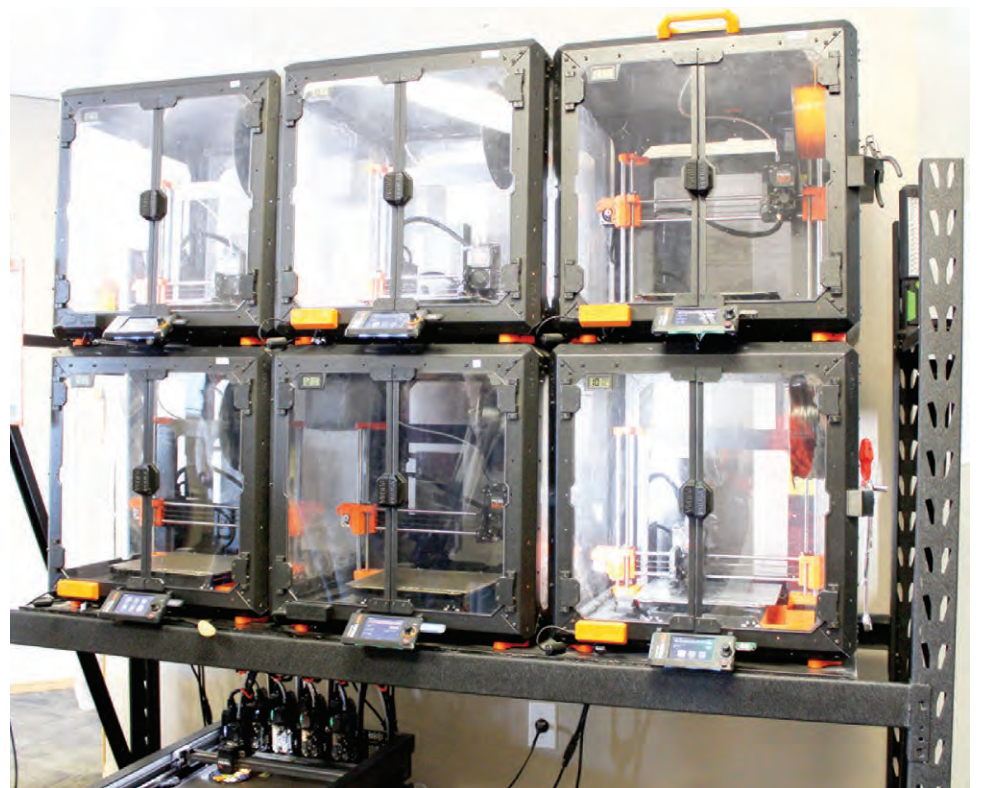
These 3D printers are working making parts.

Phil is now officially retired, but then so is Harv who still spends much time at PhiBer - where, no doubt, Phil will be much of the time, too. The knowledge and experience of the two founders is a vast resource for the next generation.