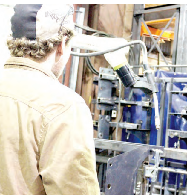
One of the welders explains how the robotic welder works. It is steadier than a person.