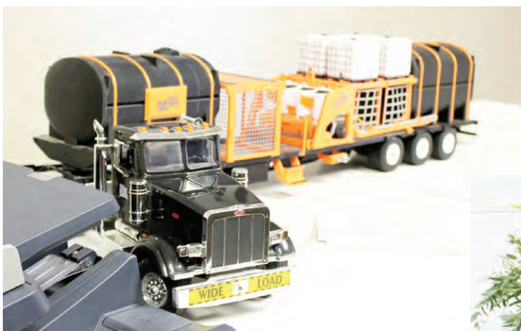
The small scale model of the DASH system was fully made by 3D printers.