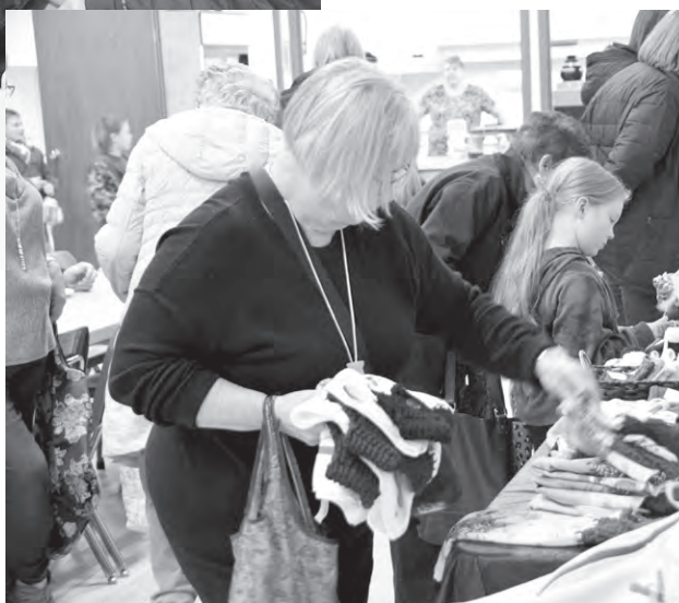
Shoppers peruse the craft tables.