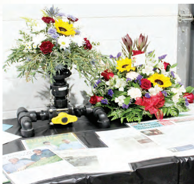
Table centrepieces and this flower "vase" were made from Banjo parts and hose fittings.