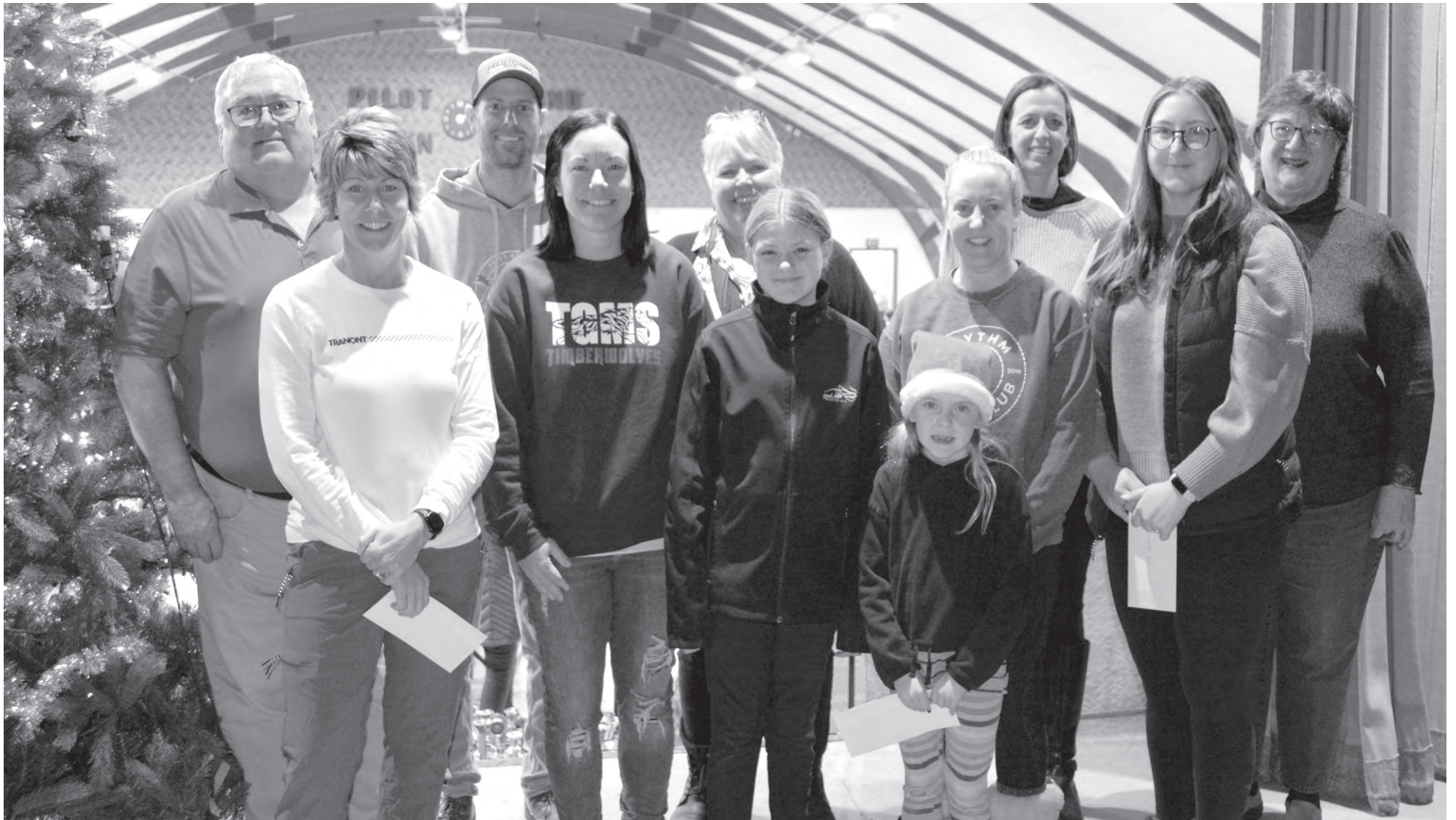
PILOT MOUND & DISTRICT FOUNDATION PRESENTED ITS FALL GRANTS AT THE MOUNDETTES' MINI MALL ON SUNDAY, NOVEMBER 24.