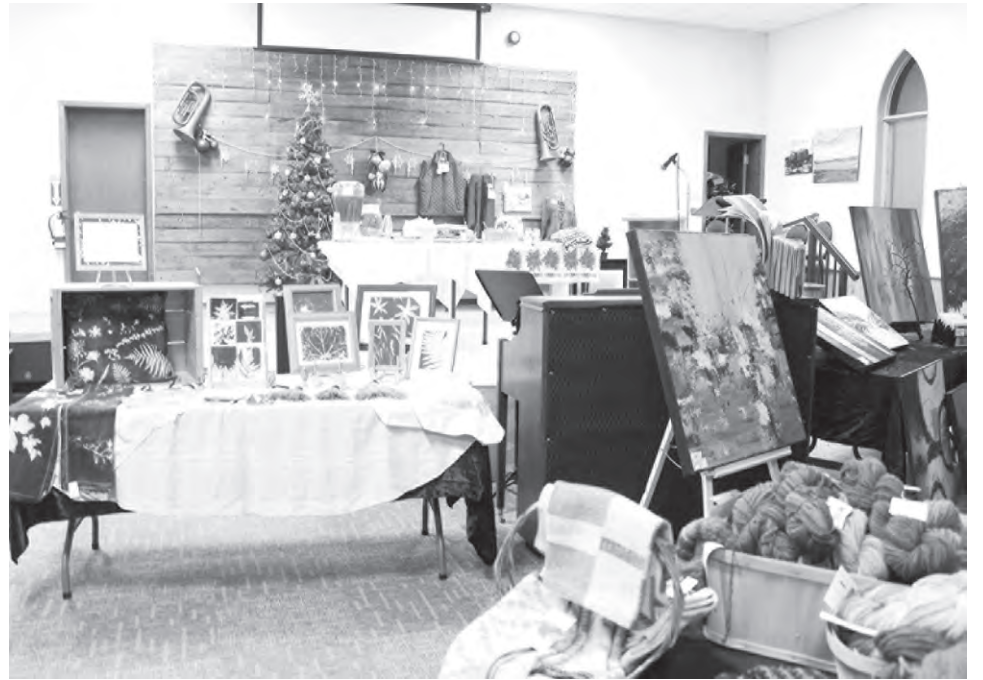
There were many displays and a silent auction.